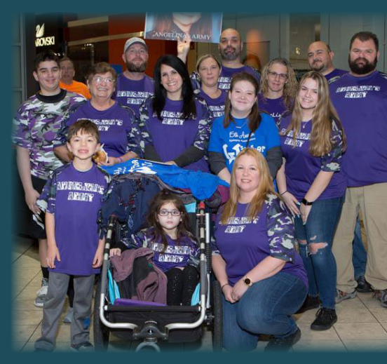
Team members from Angelina's Army