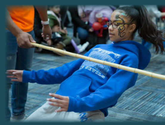
2020 Winter Walk Participant